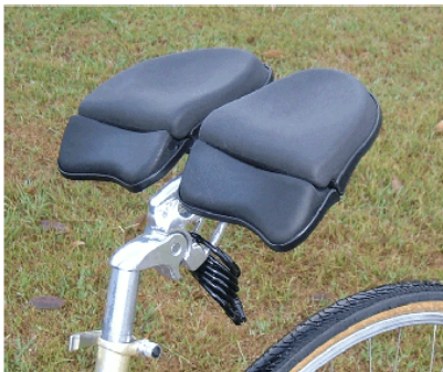
DDWings® bike seat from Italy